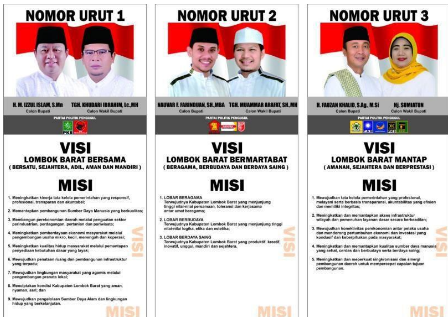
Figure 1; Tiga Calon Pilkada Lombok Barat (Putrawan, 2018, pp. 3–6)